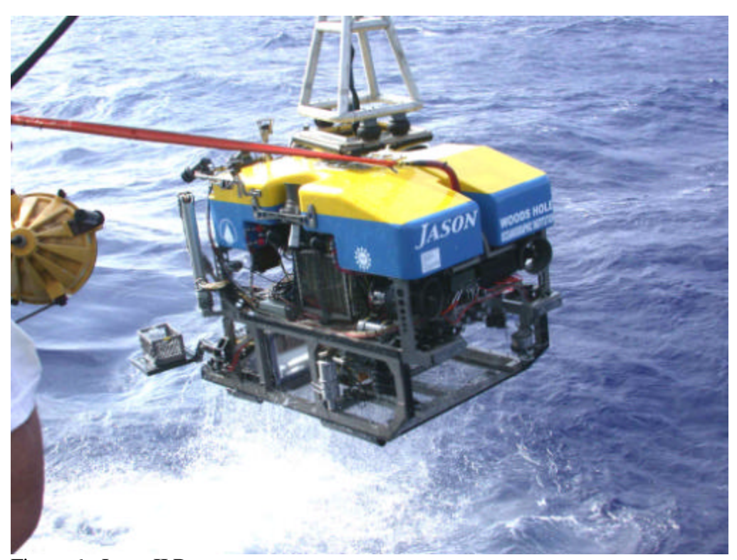
Figure 6: Jason II Recovery