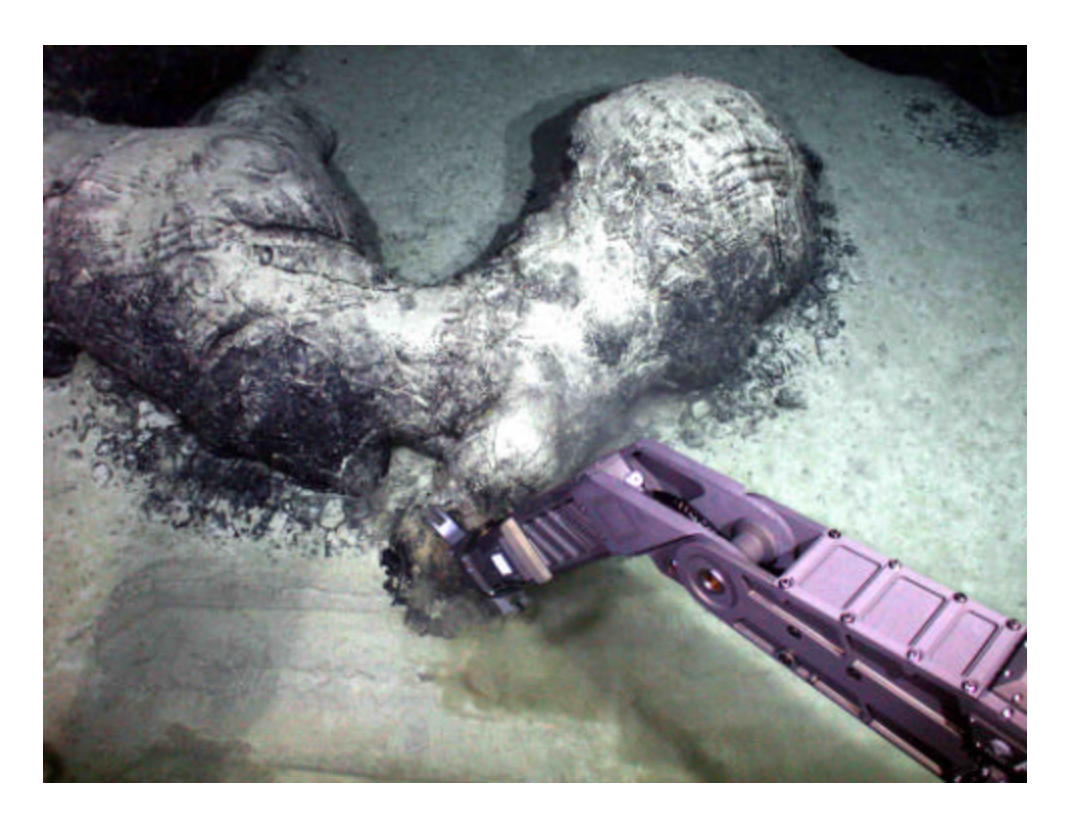
Figure 1: Jason II Sampling