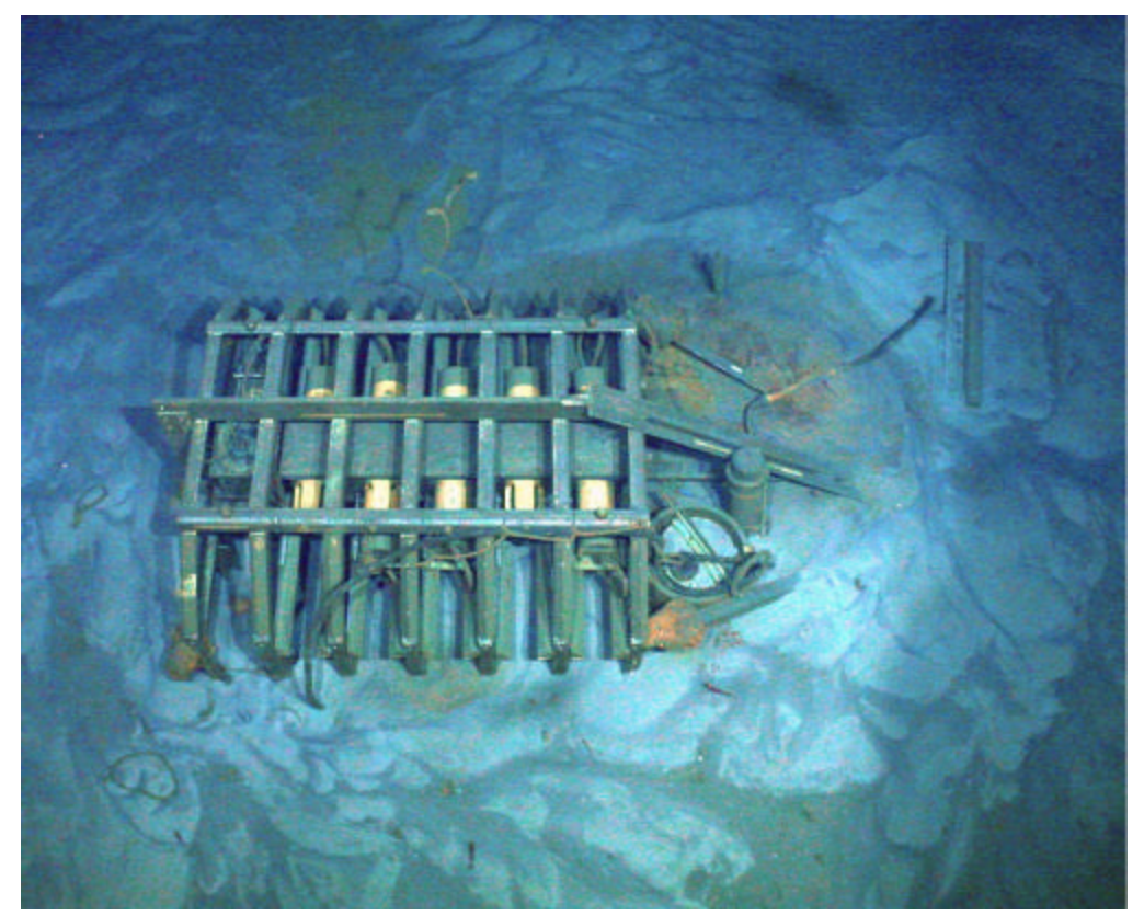
Figure 2: HUGO Approach