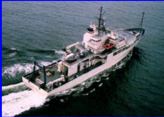
2006 - THOMPSON

Global Class SMR Steering Committee Formed