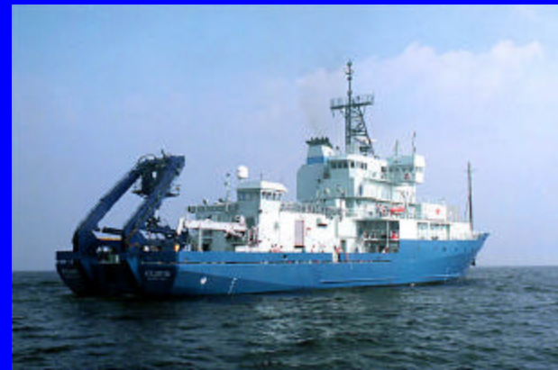
2012 - ATLANTIS