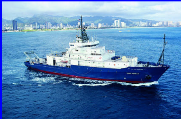
2011 - REVELLE